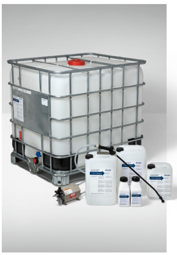
Avesta FinishOne ^{\text{TM}} Passivator 630 helps speeding up the thickness of the passive layer.

Avesta Cleaner 401 can be used together with Avesta FinishOne<sup>TM</sup> Passivator 630, which helps regenerate the protective layer in the stainless steel by speeding up the thickness of the passive layer.