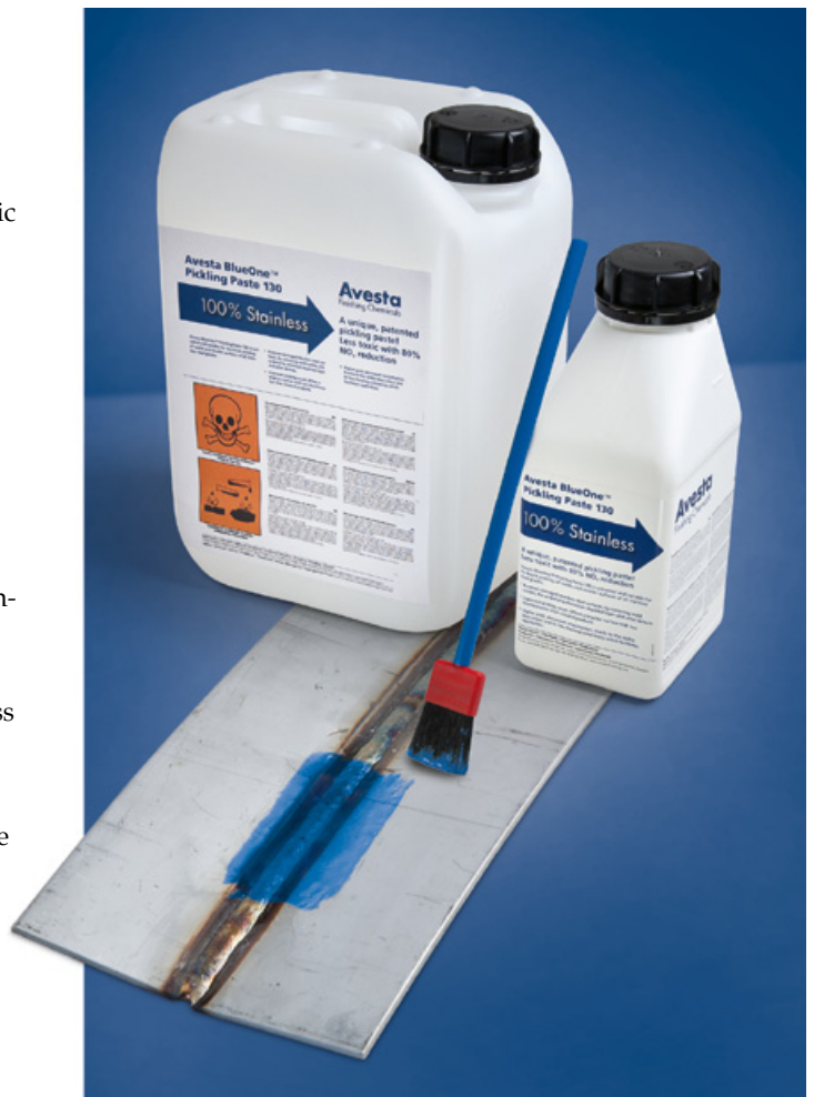
Avesta BlueOne™ Pickling Paste 130 is unique and covered by a world patent.