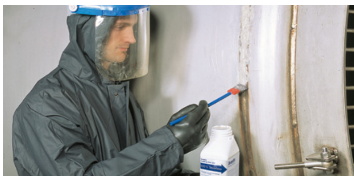
Avesta Pickling Gel 122 is easy to apply thanks to its free-flowing consistency.