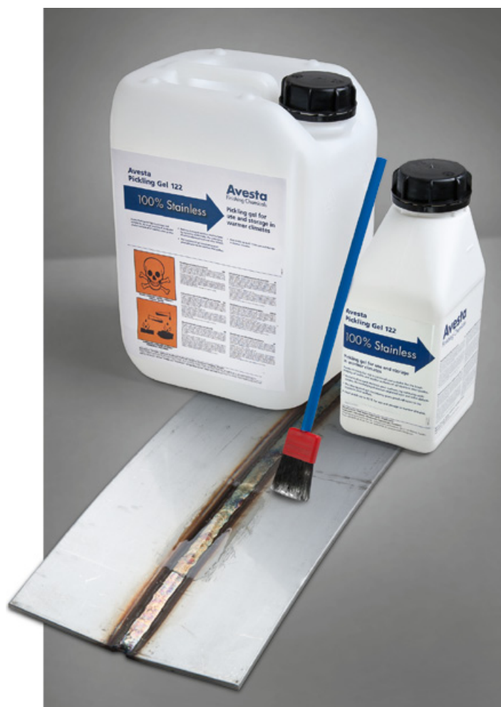
Avesta Pickling Gel 122 is intended for brush pickling of welds and surfaces.